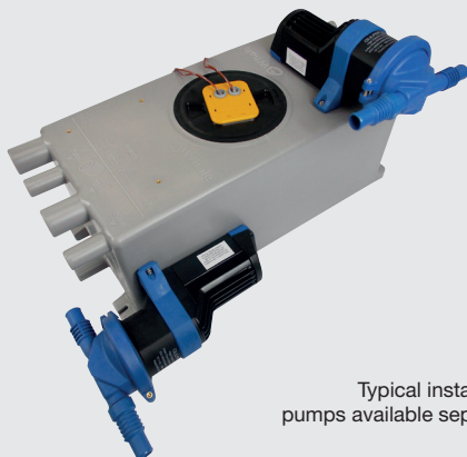
Typical installation- pumps available separately